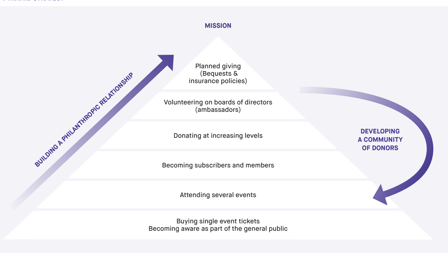
FIGURE 1 PYRAMID STRATEGY

Here is the pyramid which describes the steps in building a philanthropic relationship in arts organizations.<sup>24</sup> [ SEE FIGURE 1 ]